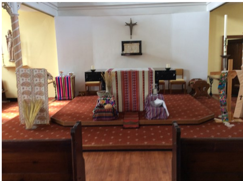
Our Church on Easter Sunday

The cloths on the sanctuary are from different countries, indeed different continents, Bolivia, India, Mexico, Guatemala, El Salvador, and Honduras and . The stole on the wooden cross was made in the Amazon, the only one in the world! The figures tell the Gospel story from the Annunciation to the Ascension of Jesus. The bowl containing the grapes is from China. These are there not just to bring colour but to remind ourselves that we belong to a global Church and that whenever we celebrate the Mass we unite ourselves with those who are living in very different, and often very difficult circumstances of abject poverty, hunger, torture, murder, the lack of human rights, committing ourselves to being in solidarity with them all.