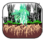
The Weedy Soil