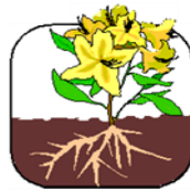
The Good Soil